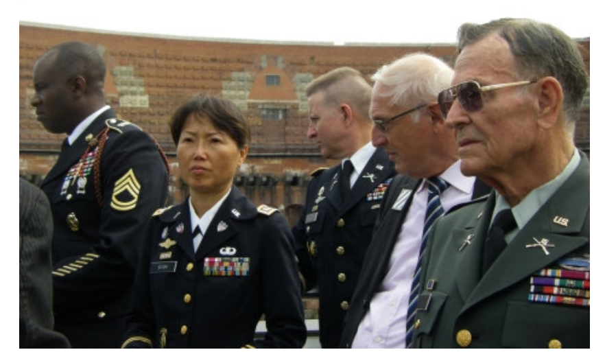
Americans and Germans at the viewpoint inside Congress Hall