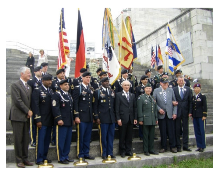
American and German participants in the ceremony posing for the photographers