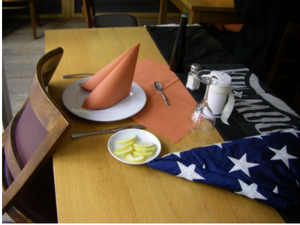
Symbolic table for 3^{rd} Infantry Division's POWs and MIAs at the dinner