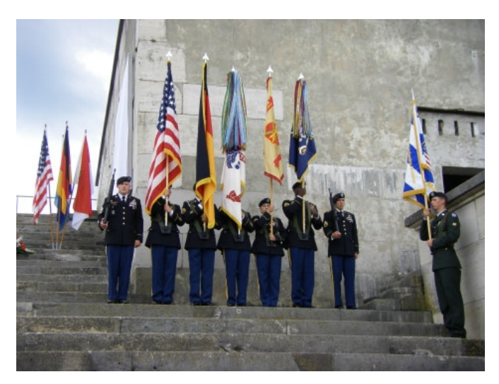
Color guard at the ceremony

May 31 was not only an official event but an opportunity for Germans and Americans to get together on a personal level to exchange views and hence hopefully lay the footing for lasting regular contacts as a consequence from a shared past, present and future.