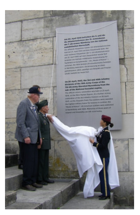
The unveiling of the plaque