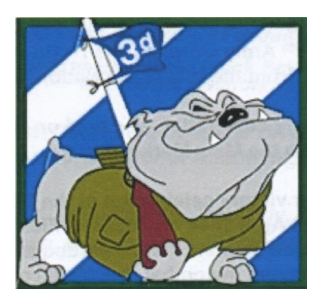
Rock of the Marne!