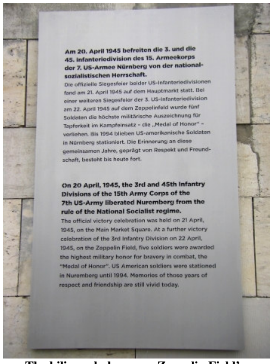
The bilingual plaque on Zeppelin Field's grandstand